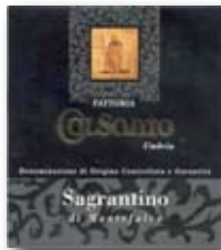
Fattoria ColSanto Sagrantino di Montefalco 2007