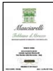
Masciarelli Trebbiano d'Abruzzo 2008