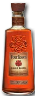
Four Roses Single Barrel