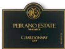
Peirano Estate Chardonnay 2009