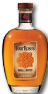
Oud Beersel Oude Geuze Vieille