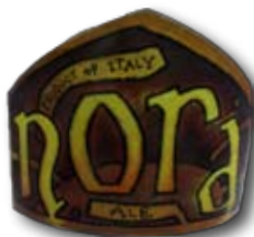
Birrificio Le Baladin Nora Egyptian Style Ale