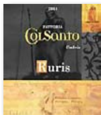
Fattoria ColSanto Ruris 2007