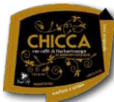
Birrificio Pausa Cafe Chicca Coffee Stout