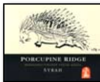
Porcupine Ridge Syrah 2008