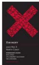
X Winery Red X 2007

Hot day? The fresh citrus flavors, crisp acidity and touch of spritz will definitely refresh you. 80% Loureiro 20% Trajadura.