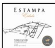
Estampa Viognier/Chardonnay 2009