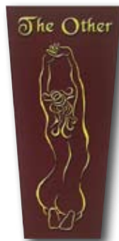
Peirano Estate "The Other Red" 2007

An unusual blend of 65% Chardonnay, 25% Sauvignon Blanc, and 10% Viognier, and it works beautifully. The aromas of apples, pears, tropical fruit, and a whiff of bubble gum are accompanied by hints of coconut and vanilla. On the palate, you will taste all those things along with homemade lemon pie. Have fun with it!